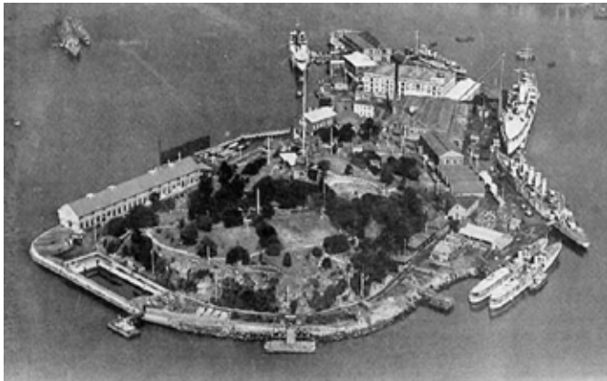
Garden Island, Sydney (c. 1929)

An example from our own backyard is Sydney's Garden Island . If you look at a modern map of Port Jackson, you will see that it isn't an island at all. But as the photo below shows, it used to be. So that's how Sydney's naval base got its name.