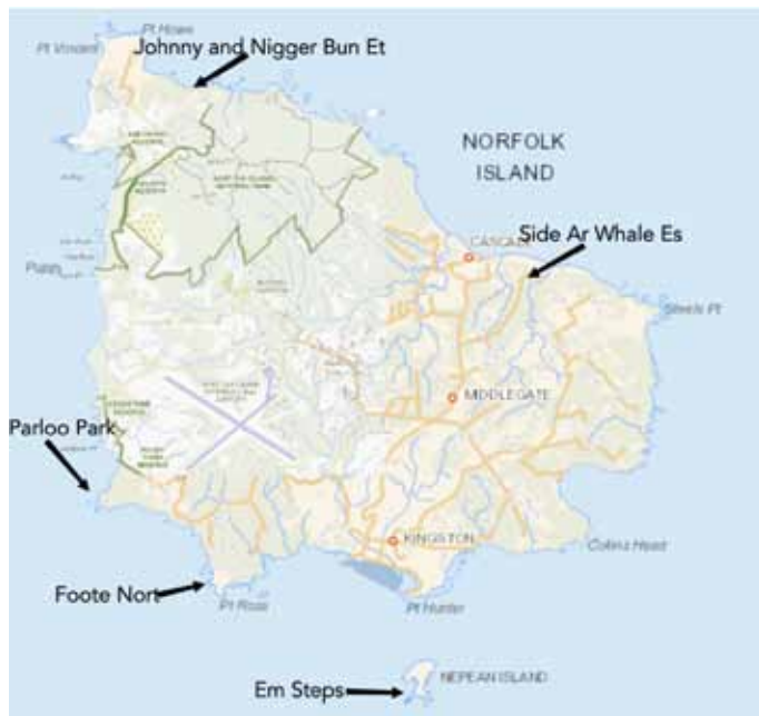
The location of five places on Norfolk Island

The first example illustrates a common trait of Norf'k phonology: word final consonant loss, i.e. Norf'k 'bun' for English 'burnt'. This is possibly a residual Polynesian feature in the language, reflecting its linguistic connection to Polynesia and Tahiti and the initial contact language that developed on Pitcairn Island after the Bounty mutiny took place in 1789. Johnny Nigger Bun Et further refers to two well-known Norfolk Islanders and the activity that led to the naming of the area: lighting wood fires so the whalers offshore would not lose their way back to shore at night. It solidifies an element of Norfolk's