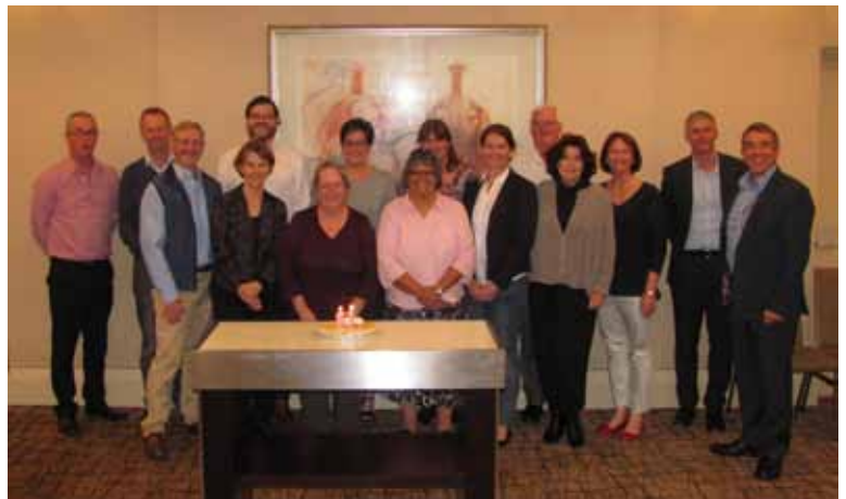
This year's PCPN conference in Perth commemorated its 30+ years of work by cutting a celebratory cake

In general, placenaming within each jurisdiction is a bottom-up process: proposals come from the public and local councils (or are referred to them for consultation), and then are processed by the relevant authority.