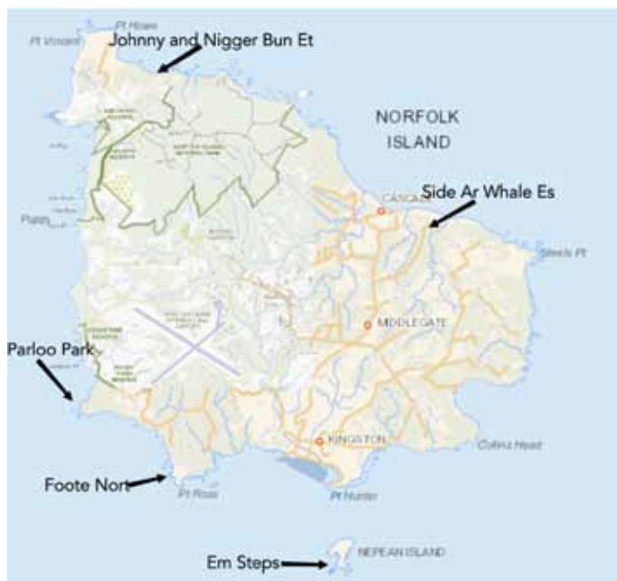
The location of five places on Norfolk Island

The first example illustrates a common trait of Norf'k phonology: word final consonant loss, i.e. Norf'k 'bun' for English 'burnt'. This is possibly a residual Polynesian feature in the language, reflecting its linguistic connection to Polynesia and Tahiti and the initial contact language that developed on Pitcairn Island after the Bounty mutiny took place in 1789. Johnny Nigger Bun Et further refers to two well-known Norfolk Islanders and the activity that led to the naming of the area: lighting wood fires so the whalers offshore would not lose their way back to shore at night. It solidifies an element of Norfolk's