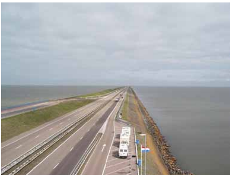
Part of the Afsluitdijk between Friesland and North Holland, The Netherlands. The IJsselmeer to the right, the North Sea to the left.

Sometimes, however, when humans alter the physical geography of a place or region, the placename is also changed. Such a case is the Zuiderzee 'Southern Sea', which was a shallow bay of the North Sea that formed a deep recess into the northwest of The Netherlands. Its name originates in the northern Dutch province of Friesland, which lies to its north (cf. the North Sea ). In 1927 work began on enclosing the bay by constructing a 32 km long dyke or causeway (the Afsluitdijk 'Closure Dyke') between the southern tip of Friesland and the