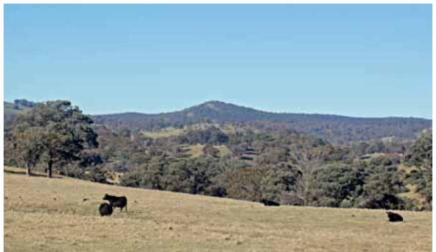
The Basaltic Rock (aka 'the pinnacle') from Thunderbolts Way

before we quit New England, we must notice the remarkable object described on the maps as the Basaltic Rock. This is an insulated, and perpendicular column of basalt, composed of hexagonal prisms closely cemented, and it forms an interesting feature of research to the geologist, and a picturesque and singular object of contemplation to the amateur tourist. 5