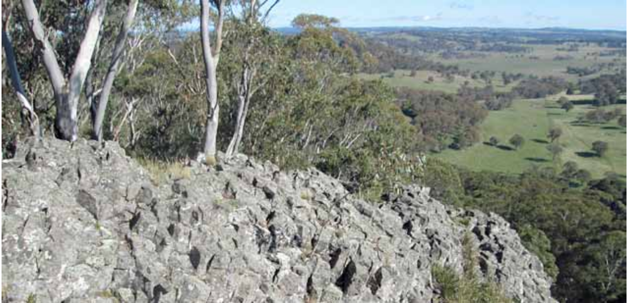
Aggregations of basaltic prisms on the summit of 'the pinnacle'