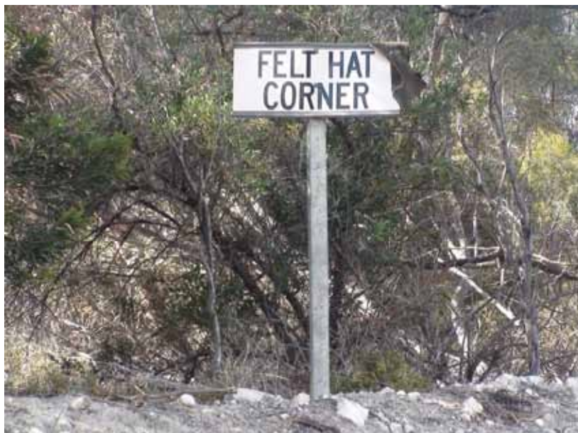
Felt Hat Corner

Many of the Dudley Peninsula names are indeed humorous ( Stomach Ache Corner , Stink Corner ), and may in some cases be linked to particular historical events (for instance, Staggerjuice Corner was so-named by a church-goer in memory of all the alcohol consumed there).