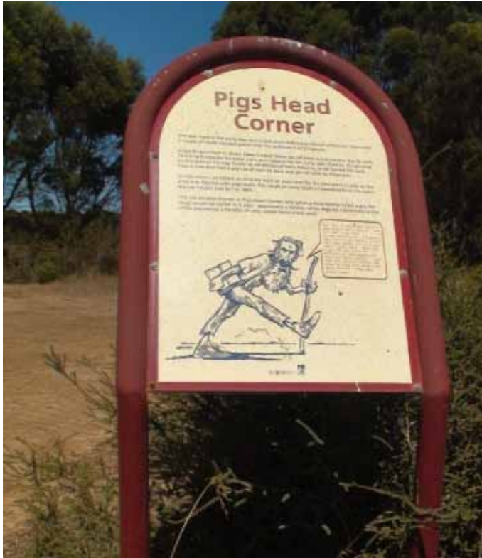
Sign for Pigs Head Corner