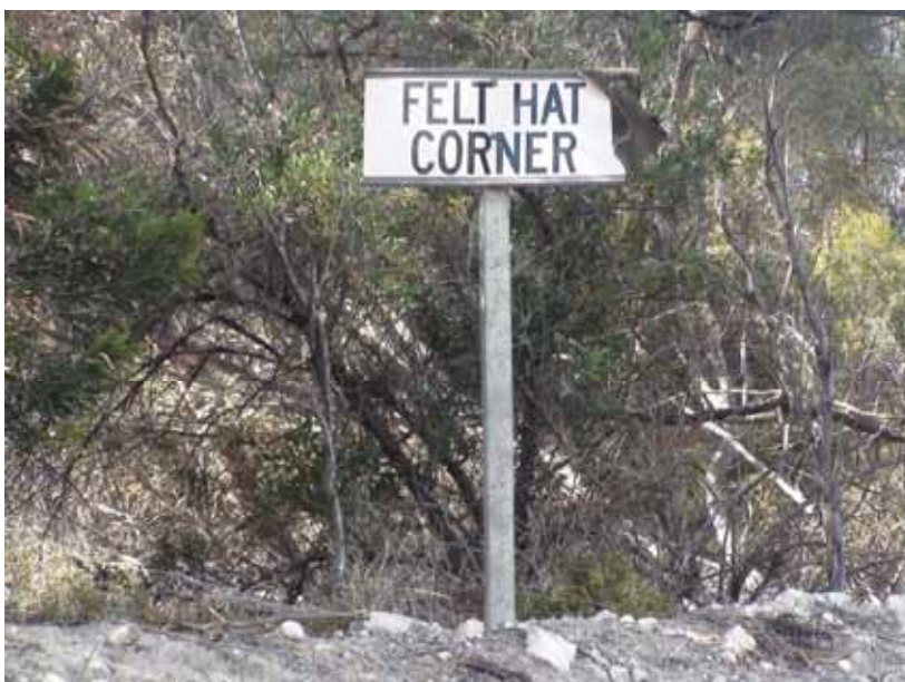
Felt Hat Corner