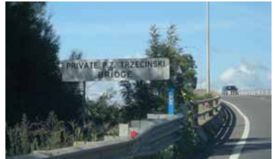
Trzecinski Bridge, Maitland

They seem just too complicated, strange or foreign to correctly read as you drive past at speed. There must be others around the country: do send us your impossible What was that name? signs for the enjoyment of others!