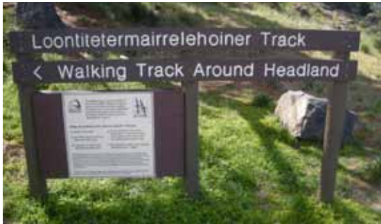
Swansea, west coast of Tasmania

Here are two other such placename signs: