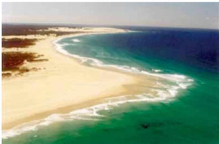
The far point is Cape Howe. Gabo Island is just off Telegraph Point shown in the foreground

But what of the boundary at Cape Howe, Australia's south eastern corner and the New South Wales boundary with Victoria? In 1971 Brigadier Lawrence FitzGerald, in an article in Victorian Historical Magazine , claimed that Telegraph Point, just to the north of Gabo Island, Victoria, was the feature that, in April 1770, Lt James Cook named as Cape Howe. 1 A number of reputable sources have since accepted FitzGerald's claim as correct, and nobody (until now) appears to have challenged it. 2 If FitzGerald is correct, he calculates that about two hundred square miles of Victoria actually belongs in New South Wales.