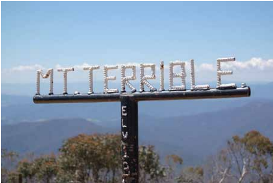
The sign at the summit of Victoria's Mt Terrible

One of the things that fascinates me with studying placenames is the endless intriguing aetiologies of many of them. This is especially the case with ones that are the result of form confusion due to a misunderstanding or bad transmission of the original form. Such is the case with Terrible Billy , a mountain in the Chichester State Forest in eastern NSW, close to the towns of Gloucester, Dungog and Stroud. How did this name come about? Major Thomas Mitchell supplies the answer. The entry for December 9, 1831 in his journal states: