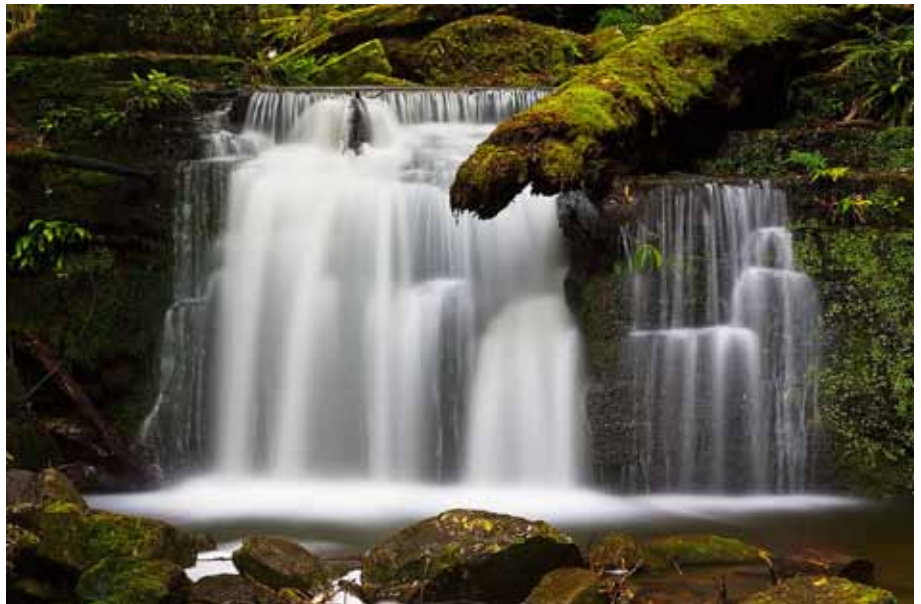
Strickland Falls on Hobart Rivulet