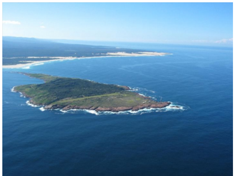
Gabo Island with Telegraph Point, the nearest point on the mainland, and Cape Howe beyond

being in New South Wales, on that State's coast there are 26 toponyms bestowed by Cook. Four of these, Cape St George (actually part of Jervis Bay Territory), Long Nose at Jervis Bay (see Placenames Australia , June 2017), Black Head near Port Stephens, and Point Danger, are in the wrong places on today's maps.