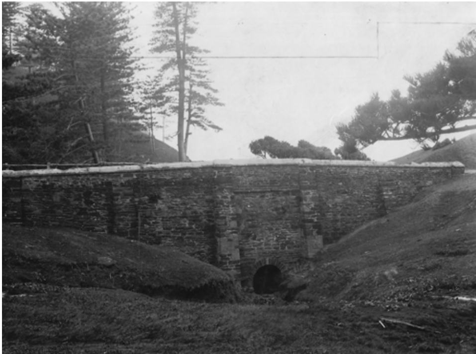
Bloody Bridge, Norfolk Island

Apart from Cross ar Water , the wooden bridge which crosses the creek at the bottom of the valley that separates New Cascade and Cascade Roads, all Norfolk bridge names are pejorative. Does this, we wonder, indicate a disdain the Norfolk Islanders may have had for parts of their new island home and its associated history? Or is it somehow related to the taunting and jeering nature of the language itself?