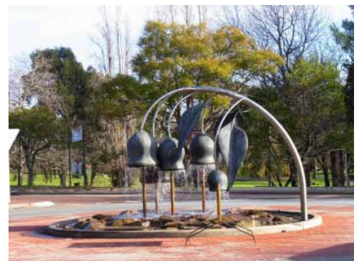
Kalamunda’s welcoming fountain-sculpture