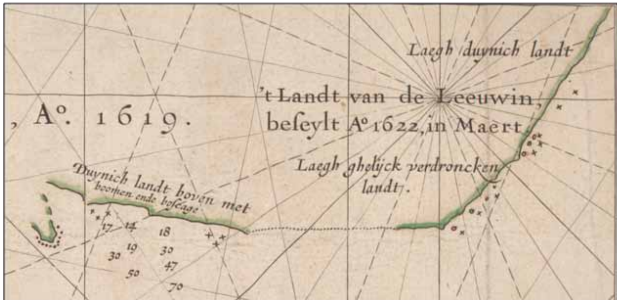
Figure 4. Section of the Hessel Gerritsz. (1627) map, Caert van 't Landt van d'Eendracht [...] (Map RM 749).

toponym, resulting in a distortion of its form. An example can be found on two versions of a 1753 map of Australia by the French cartographer, Jacques-Nicolas Bellin. On the French edition, there appears Terre de Wit (near today's Port Hedland, WA, and named after the Dutch explorer Gerrit Frederikssoon de Wit), and underneath that Terre Blanche . On the German edition of the map, he shows Wit Land (not de Wits Land , De Witts Land , or G.F. de Wits Landt as is usually depicted on maps), below which is written Weisse Land . Now wit in Dutch means 'white', but by translating it into French as Terre Blanche and German Weisse Land 'White Land' he has changed the meaning of Wit from a personal name to a descriptive adjective. It seems the translation from Terre de Wit (personal name) to Terre Blanche (descriptive adjectival name) led to the German edition of the map equating the appellation Wit Land (descriptive adjectival name) with its German translation equivalent Weisse Land .