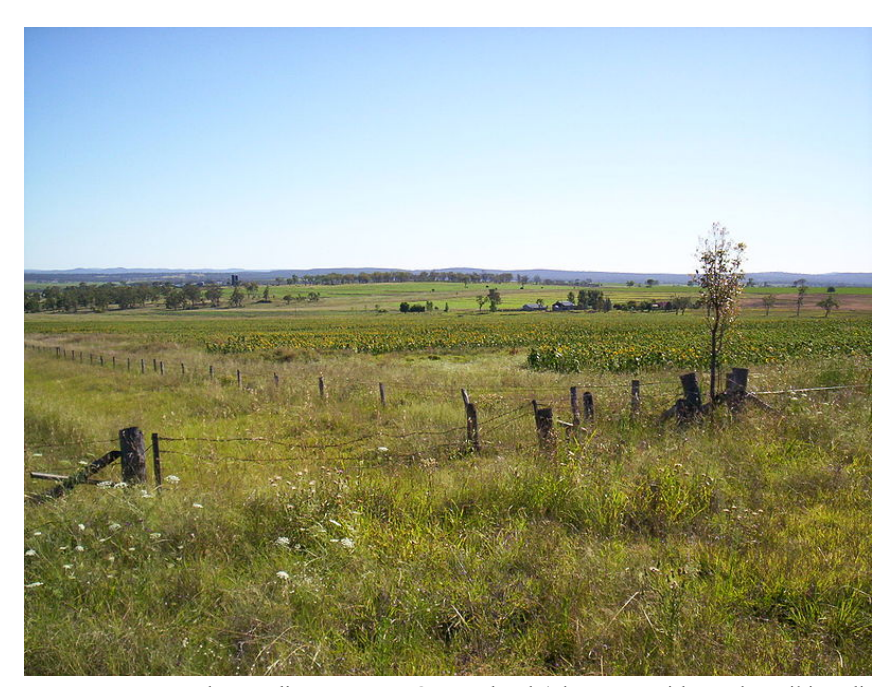
Fences on the Darling Downs, Queensland