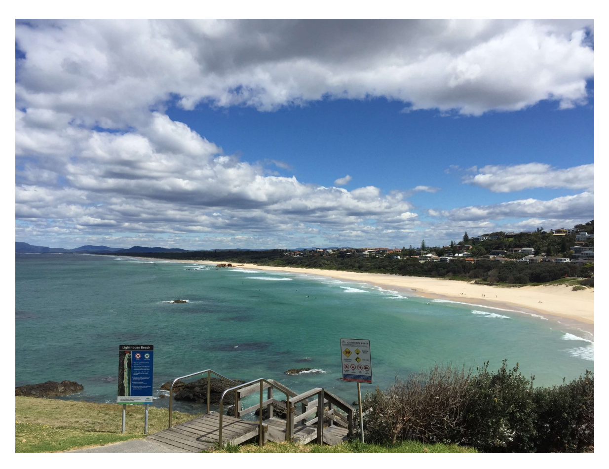
Lighthouse Beach at Port Macquarie, SLSA172