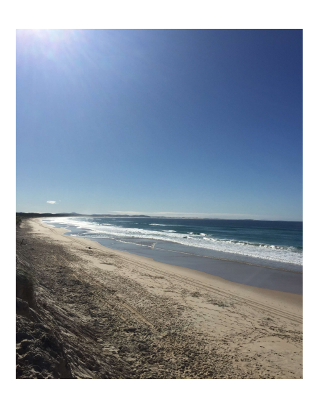
Bennetts Beach at Hawks Nest, SLSA223