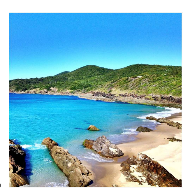
Burgess Beach, SLSA199

The general assumption for the entries is that the included generic is 'Beach'. The entry for Iluka therefore represents the toponym Iluka Beach . In cases where the authority omits the generic or uses another, the toponym appears in square brackets: [Pipers Hill], [Queens Head]. In some of these cases, it is not clear whether the beach name simply lacks a generic or whether the beach is, in fact, unnamed (and the listing merely implies 'the beach at Pipers Hill / Queens Head'). This problem does not arise with the GNB entries because, as noted above, the feature type always makes it clear whether the toponym is that for a BEACH or for an associated nearby feature.