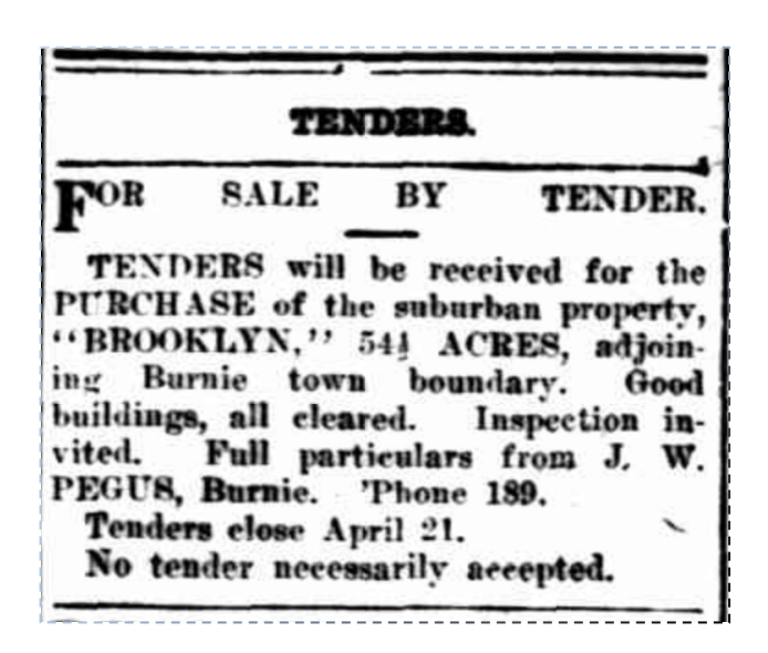
Figure 2 Real estate advertisement in The Advocate for 'Brooklyn', Burnie.

This is a suburb of Burnie (on the north-west coast) to the south-east of the main town centre. I have not been able to establish with certainty the motivation for the naming of this suburb, but a real estate advertisement in The Advocate (Burnie) of 5 April 1921, page 4, announces the sale of the property 'Brooklyn' (Figure 2). This suggests the suburb derives its name from that property, which was well-known in the town. It is not unusual for a suburb or town to be named after a local property (cf. Lakemba in Sydney).