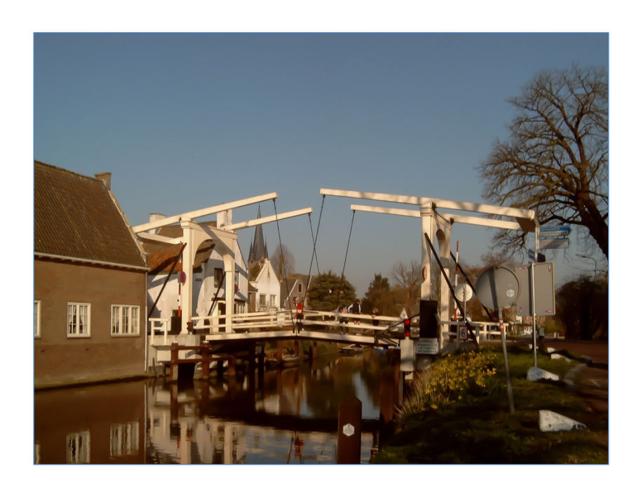
Figure 8 The lift-bridge over the Vecht at Breukelen , near Utrecht, The Netherlands