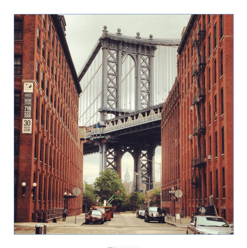
Figure 7 Brooklyn (NY) and its famous eponymous bridge