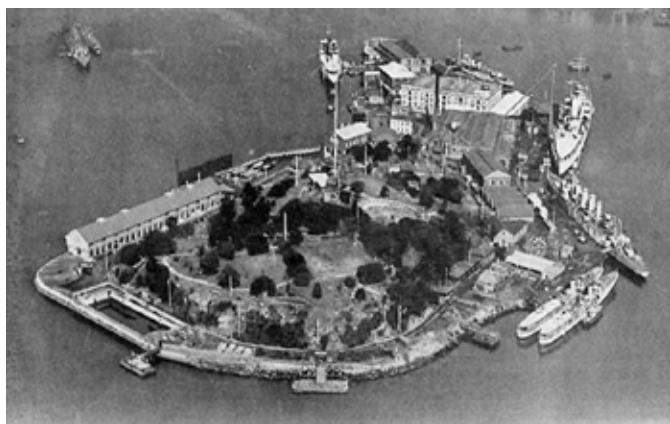
Garden Island, Sydney (c. 1929)

An example from our own backyard is Sydney's Garden Island . If you look at a modern map of Port Jackson, you will see that it isn't an island at all. But as the photo below shows, it used to be. So that's how Sydney's naval base got its name.