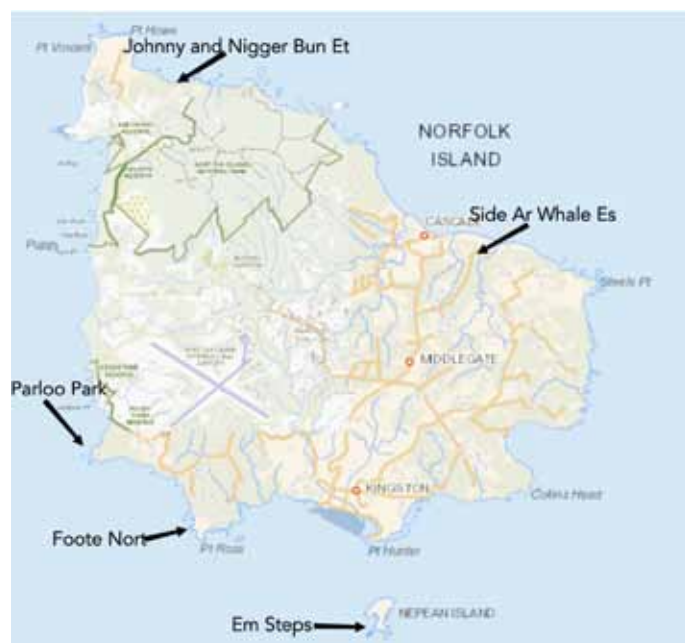
The location of five places on Norfolk Island

The first example illustrates a common trait of Norf'k phonology: word final consonant loss, i.e. Norf'k 'bun' for English 'burnt'. This is possibly a residual Polynesian feature in the language, reflecting its linguistic connection to Polynesia and Tahiti and the initial contact language that developed on Pitcairn Island after the Bounty mutiny took place in 1789. Johnny Nigger Bun Et further refers to two well-known Norfolk Islanders and the activity that led to the naming of the area: lighting wood fires so the whalers offshore would not lose their way back to shore at night. It solidifies an element of Norfolk's