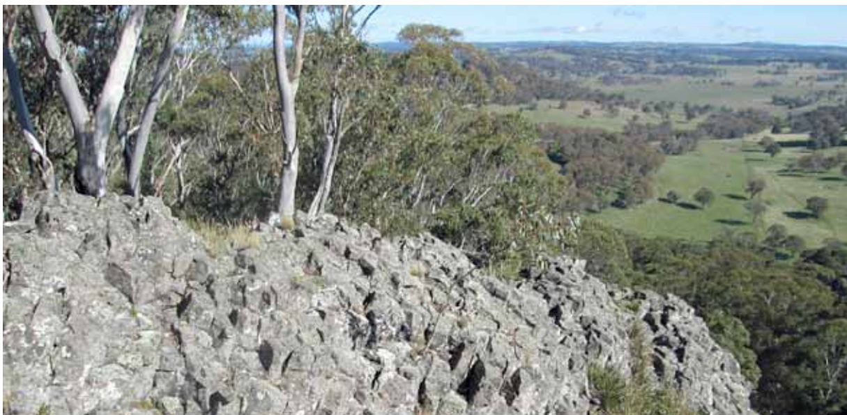
Aggregations of basaltic prisms on the summit of 'the pinnacle'