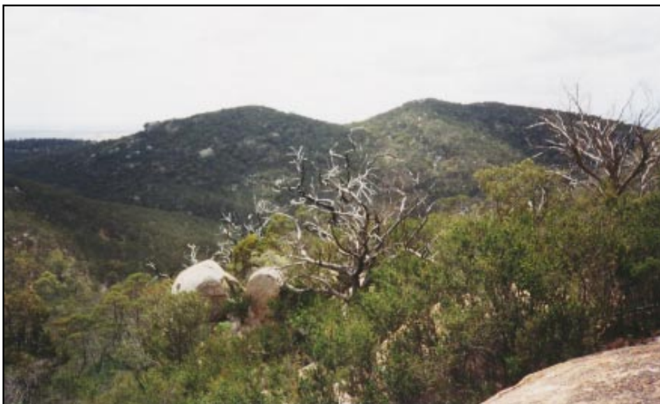
View from the path that circles Flinders Peak.