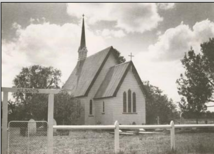
Heritage listed All Saints Anglican Church, the defining landmark of the Yandilla area and oldest building in the Millmerran Shire (Queensland). Built 1877. Photograph taken 1981.