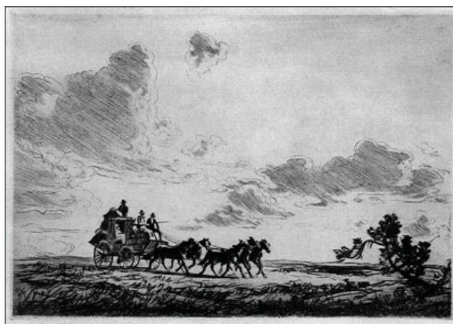
Cobb and Co Etching By Lionel Lindsay