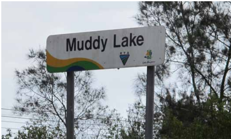
Muddy Lake sign, near Dora Creek (NSW)

Just after you drive through Dora Creek, on the western shore of Lake Macquarie, NSW, on the way to Toronto, you drive over a causeway that divides a small lake. Its sign-posted name, Muddy Lake , stuck me as unusual, because most lake names read Lake X , such as Lake Cargelligo , Lake Macquarie , Lake Eyre , Lake Jindabyne , Lake Pedder , Lake Wobegon , or so I thought. Muddy Lake looks more like a descriptor than anything else. ‘Perhaps’, I thought, ‘toponyms with the form X Lake might be more descriptive in nature than the Lake X form.’ There was only one way to find out; go to the Gazetteer of Australia and do an analysis. 1