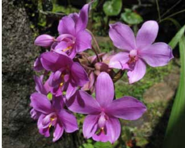
One of Taveuni's many orchid species

Another example is the noun sawa , meaning ‘beach, landing place’. It occurs in two perfectly normal village names, Sawanikula ‘landing place of red lorries (a kind of small parrot)’ in Naitasiri, and Sawanivo ‘beach/landing place of gobies (a kind of small black freshwater fish)’ in Ra; but it also occurs in its truncated form, Sawani , the name of two villages, one in Bua and the other in