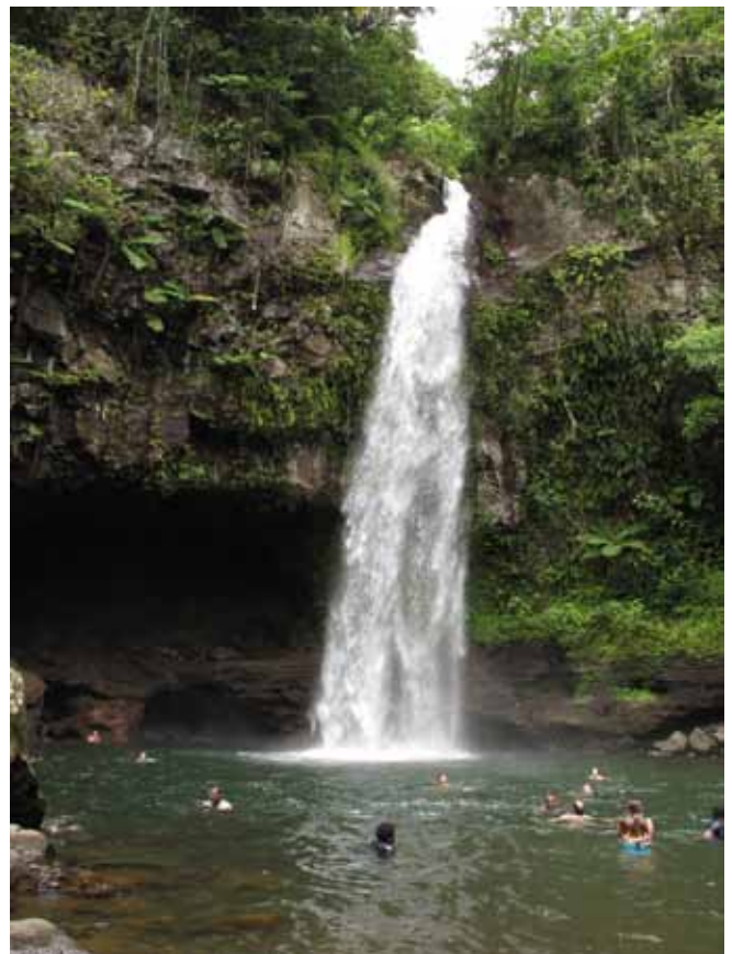
Bouma Falls, Taveuni

river'. There are about twenty villages thus named, such as Wainiura 'prawn river', Waininubulevu 'river of the big pool', and Wainikai 'river of freshwater clams'. Other nouns that are often suffixed in the same way are koro 'mountain, village', mua 'end', and qara 'cave', as in Koronikalavo 'mountain/village of rats' in Serua, Muaninuku 'end of sand, i.e. sand-spit' in Kadavu, and Qaranivai 'cave of stingrays' in Macuata.