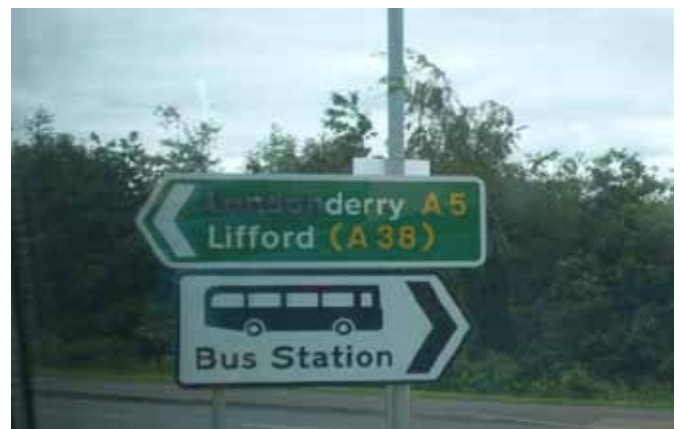
A clear political statement

The dates when places are renamed reveal a political and historical story, and none more so than the renaming of two cities in Russia: