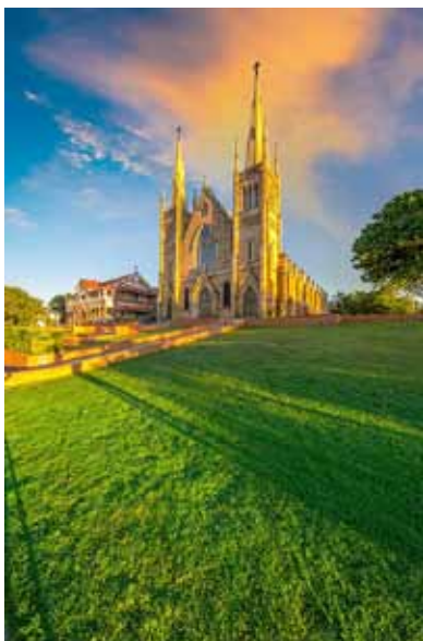
St Marys Cathedral, Ipswich

It is generally accepted that it was named after the English town of Ipswich, but there is no obvious reason for the name to have been transported to southern Queensland. So far as we know, none of those responsible for the naming had any connection with the English town; and the Australian site bore little geographic resemblance to the Ipswich on the estuary of the River Orwell in Suffolk.