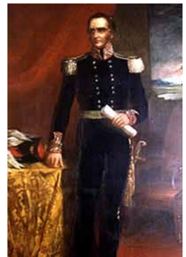
Governor George Gipps

This second proposed meaning suggests an intriguing possibility, one that implicates the governor of the time in a little cryptic self-promotion. George Gipps (1791-1847) was governor of New South Wales from 1837 to 1846. Although the district in Queensland had been known as Limestone since at least 1827, a town plan was submitted to Governor Gipps by surveyor Henry Wade in 1843 and in that plan the town name was shown as Ipswich .