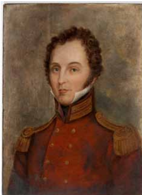
Governor Richard Bourke