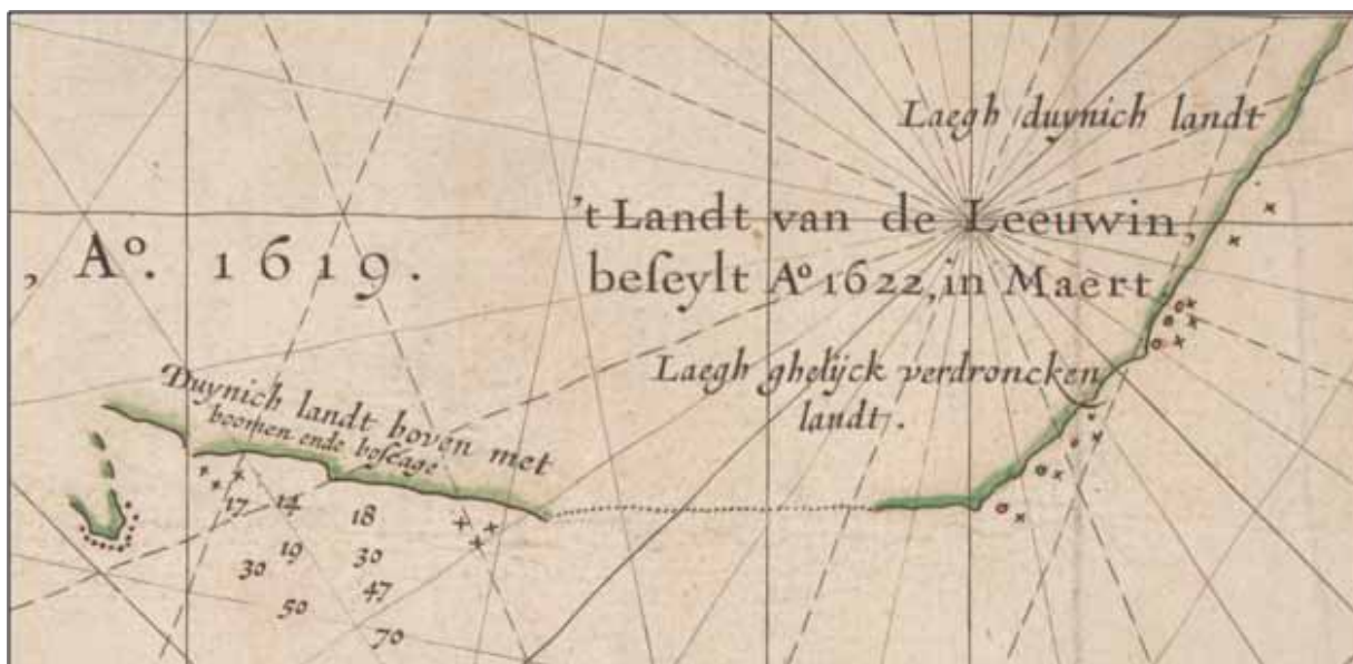
Figure 4. Section of the Hessel Gerritsz. (1627) map, Caert van 't Landt van d'Eendracht [...] (Map RM 749).

toponym, resulting in a distortion of its form. An example can be found on two versions of a 1753 map of Australia by the French cartographer, Jacques-Nicolas Bellin. On the French edition, there appears Terre de Wit (near today's Port Hedland, WA, and named after the Dutch explorer Gerrit Frederikssoon de Wit), and underneath that Terre Blanche . On the German edition of the map, he shows Wit Land (not de Wits Land , De Witts Land , or G.F. de Wits Landt as is usually depicted on maps), below which is written Weisse Land . Now wit in Dutch means 'white', but by translating it into French as Terre Blanche and German Weisse Land 'White Land' he has changed the meaning of Wit from a personal name to a descriptive adjective. It seems the translation from Terre de Wit (personal name) to Terre Blanche (descriptive adjectival name) led to the German edition of the map equating the appellation Wit Land (descriptive adjectival name) with its German translation equivalent Weisse Land .