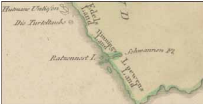
Figure 1. Section of the von Reilly (1795) map, Karte von des Inselwelt Polynesien odeim Funften Welttheile[...] (Map NK 1545).

There is one name near the Swan River which I didn't cover in great detail, even though it appears on a number of maps in various forms—from Djurbert (1780) to Sotzmann (c.1840) 2 —viz. Dinnings Land , Dinning's Land , Dinning Land , Terres de Dinning , or Pais de Dinning (see Figure 1 for one example).