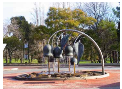
Kalamunda’s welcoming fountain-sculpture